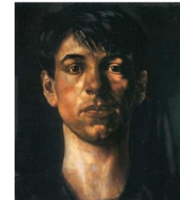
Self Portrait (1911+)