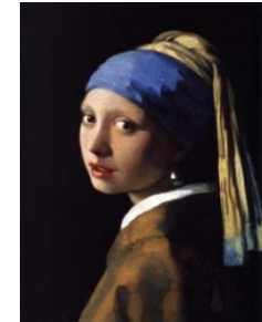
Girl with the Pearl Earring (1665)