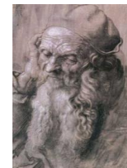
Old Man aged 93 (1521)