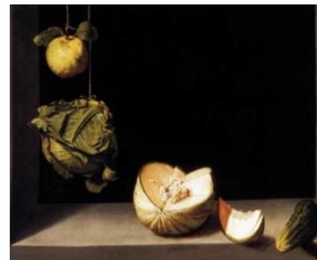
Quince, Cabbage, Melon and Cucumber (1602)