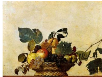
Basket of Fruit (1595 – 1596)