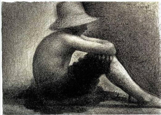
Seated by with a Straw Hat (1883)